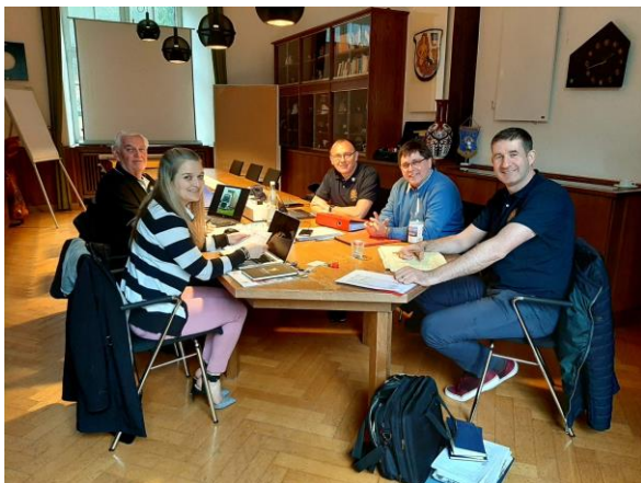
Ensuring the IPA accounts are in order: the internal auditors meeting 2019