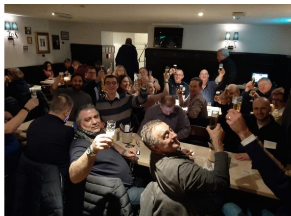
Enjoying some social time together after successful meetings

As part of the accompanying programme, the new building of the District Police Authority Oberbergischer Kreis and the brewery 'Gilden im Zims' in Cologne were visited.