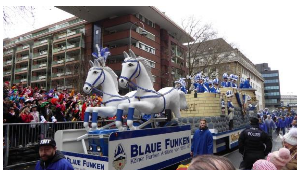
Egal wie schlecht das Wetter auch sein mag: D'r Zoch kütt!