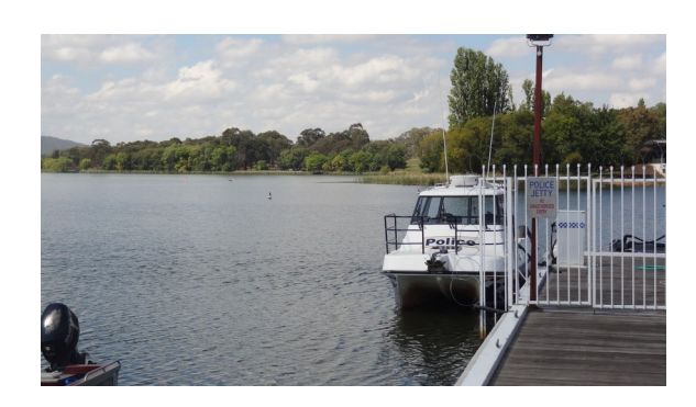
Top left—"water craft" Top right—"patrol boat"