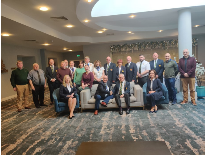
Photo of Sections UK and Ireland NEC members, Region Louth Committee members and Region 2, Section UK Committee members