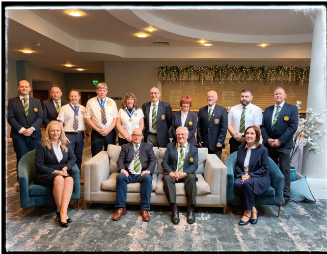
Joint Meeting of Sections UK and Ireland National Executive Committees